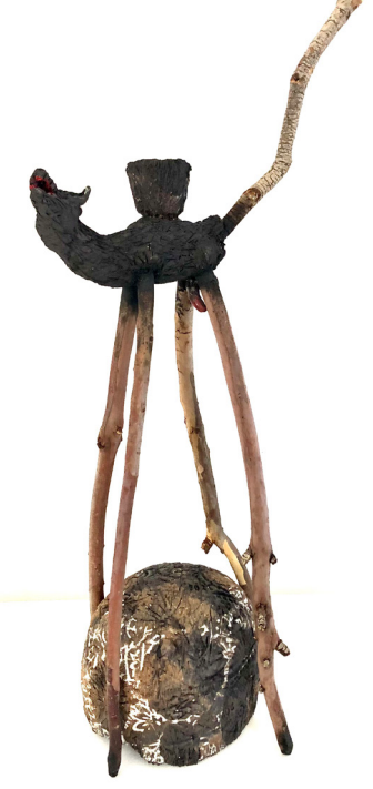
Beasts Lurk In My Garden, 2022 recycled clay, twigs