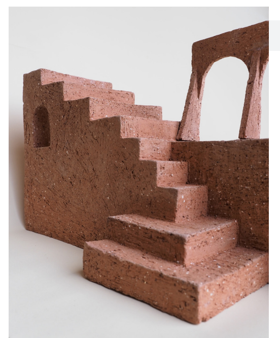
Thoughts of Cities (detail), 2022 stoneware clay

e: t.pinker@hotmail.com ig: @cooked.dirt