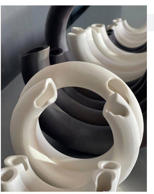
to break, and enter (detail), 2022 porcelain, black stoneware

e: stellasulak@gmail.com ig: @stella.sulak.sculpture