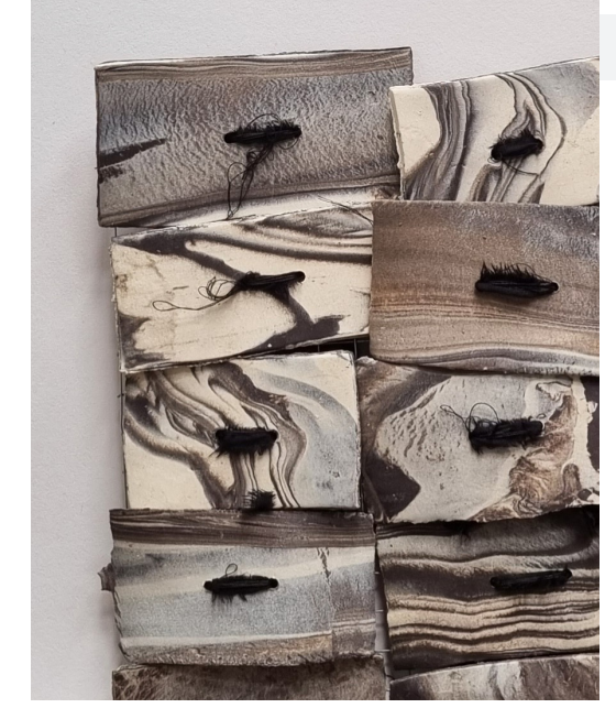
Crowded (detail), 2022 porcelain, black stoneware

A shared space is what brought this group of individuals together. We are all connected in various ways to ClayMake Studio, and have become connected to one another through the sharing of the physical studio space. We now share and shape the space held within the East Gallery of Midland Junction Arts Centre.