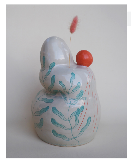
Get a Little Bit of Sun (Not Too Much), 2022 stoneware clay