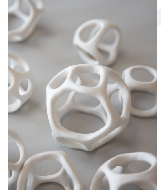
The Space Between (detail), 2022 porcelain