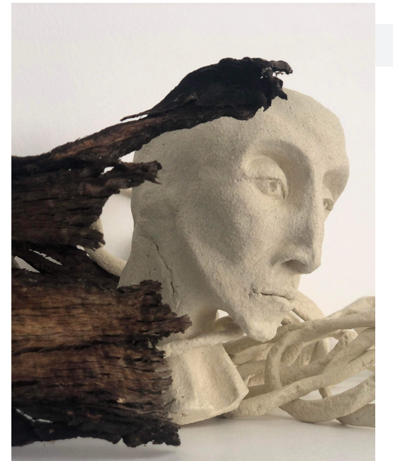
Shaping the Space of Our Future (detail), 2022 stoneware clay