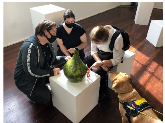
Vision awareness consultation of TAP (Tactile Art Project) .

TAP and Blue Beautiful will be celebrated on Friday 28 May from 6:30pm - 8pm, with a musical performance by The Definitives and will be officially opened by City of Swan Mayor, Cr Kevin Bailey. Both exhibitions are on display until 17 July.