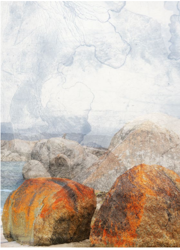
Monika Lukowska, Topographies I , 2022, digital print, 56 x 43 cm.

Lukowska's work originates from explorations of southern landscape of WA. Within the vast landscape she is drawn to million-year-old rocks, granites, stromatolites, and dramatic coastal landscapes formed during the collision of continental masses. Lukowska considers those formations not only as invaluable parts of the environment but as elements that "tell" stories. Almost like palimpsests, they retain layers of local history, geological data and hold spiritual significance for Indigenous groups. Through creative practice, Lukowska engages with their materiality and gradually unravels their entangled complexities and hidden meanings. The experiential knowledge of place, gained through an active engagement with the sites, is then translated into artworks that aim to emulate the close connectivity of the body and place and to flesh out the place's tactility and highlight its importance.