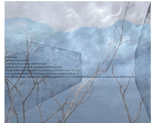
Nikki Green, Place Where the Eye and Clouds are Drawn , with excerpt from Nowanup by Reneé Pettitt-Schipp, 2022, digital print on archival paper, 27.5 x 36 cm.

Pettitt-Schipp's series of poems for Tracing Gondwana seek to explore the tensions and contradictions in what it means to be a seventh generation white West Australian living in the shadow of a complex colonial history as well as in the contemporary context of a climate emergency, while being surrounded by abundance and beauty.